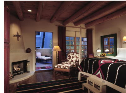
Superior King with Balcony 410 sq. ft.