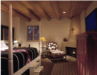
Traditional 300 sq. ft.