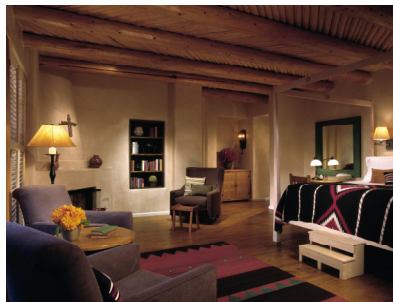
Deluxe 500 sq. ft.