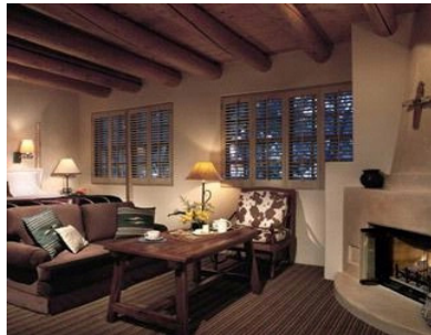
Superior 370 sq. ft.